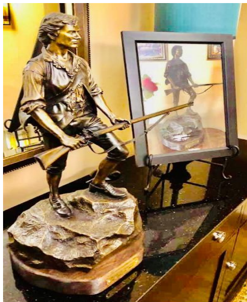
Sons of Liberty Statue

As a fundraiser for the July 2023 133 rd National SAR Conference in Orlando , FLSSAR is holding a drawing for a limited edition bronze sculpture titled the "Sons of Liberty" (#10/50) crafted by world famous sculptor James N. Muir . Valued in excess of $6,000, the drawing tickets are just $25 each or 5 for $100 . Mail your check to FLSSAR Statue c/o Palm Beach Chapter, PO Box 16735 West Palm Beach FL 33416 .